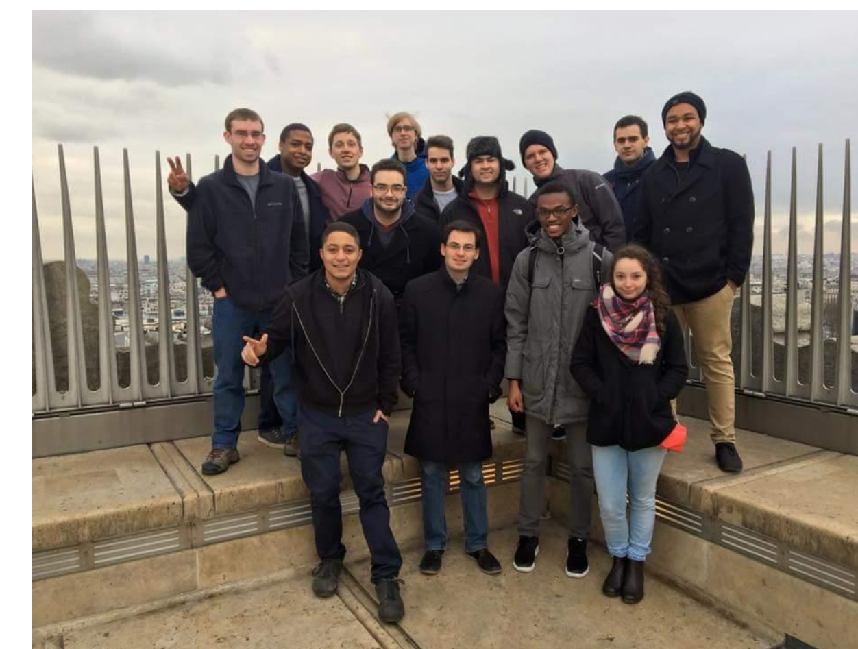
Figure 3: The UB, University of Michigan, University of Pittsburgh, and ENSEA students on top of the Arc de Triomphe.

Our time abroad allowed us to get acquainted with France and make new friends along the way. We had the privilege of meeting wonderful professors and fellow students from ENSEA who were more than willing to show us around and help us get settled in. We also had the opportunity to meet people from countries outside of France as well on our travels throughout Europe.