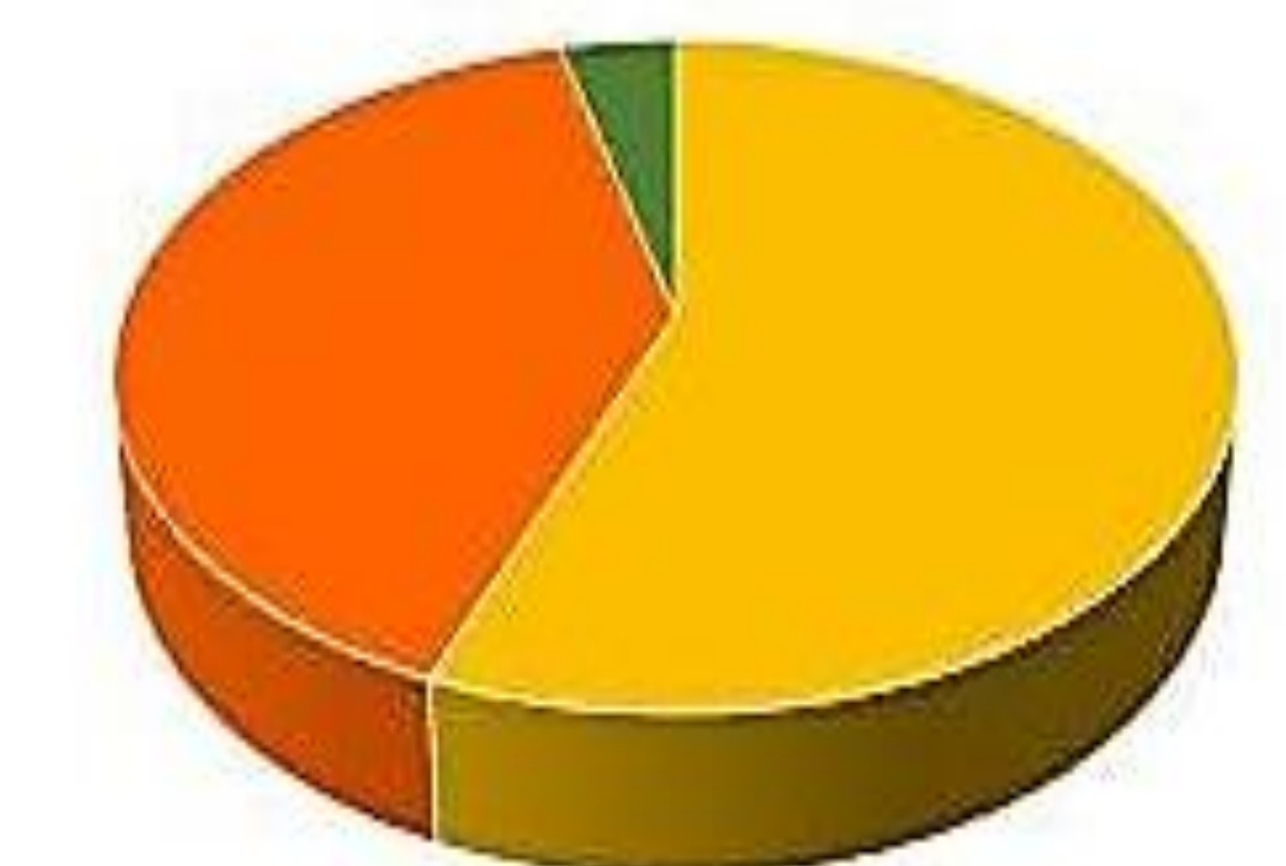
Impact of Prison Programs on the Rate of Recidivism

In conclusion, recidivism is at an all time high in the United States and it continues to increase. But with education programs, the United States can reduce the rate of recidivism. If the United States begins to invest more of their money in education programs for many prisons, there will be a decrease in recidivism nationwide. That will then lead to less unnecessary spending on prisons.