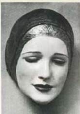
Golden Beauty Mask W.T. Benda

Being exposed to such ideals of mask hurtled me into the first stages of my designs.