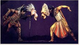
Lion King Mask and Puppetry

FINAL OBSERVATIONS: Even Simplicity is Complex Creating something that appears simple in shape and form can be an incredibly complex task.